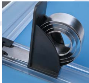
SLIDELINE Pusher Systems

Choose innovation and dependability with HS Spring.